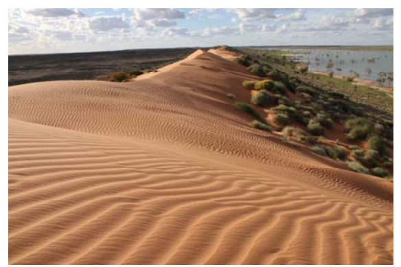
Vic's winning photo

I am a subscriber to Australian Traveller Magazine, what I term a high end travel magazine, which features the type of places most of us dream of visiting rather than ever actually getting there. Anyway, each month they run a photo competition for their readers and after a few months I decided to submit a photo to see how I went in the competition, the photo accompanies this article below.