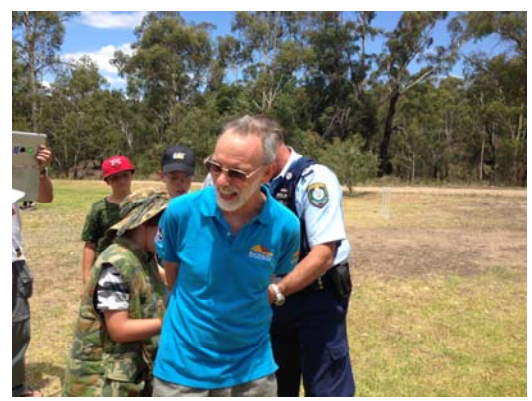
Hmm maybe its not the people you know but what you say!

from Batemans Bay had dropped into Castle View to say hello to the kids. It seemed a little odd having a Police vehicle and uniformed policeman at the training centre, then he hand cuffed me and told the kids to get me, thanks a lot!