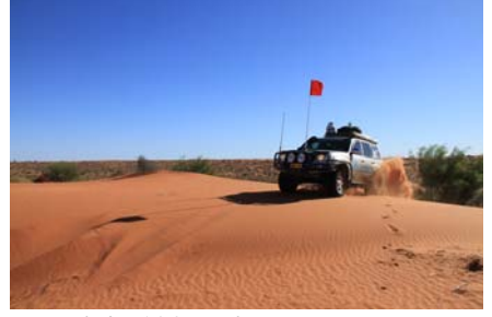
Vic's 100 series led the way

After a record heat wave across Australia during Summer, we knew the Simpson was going to be at its blistering best. In fact, with several consecutive days above 50 degrees during February I expected the sand to be very soft, we weren't disappointed either!