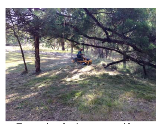
Tony enjoyed using my new ride on mower

The week didn't quite go as planned however, with the cops and kids arriving on Monday afternoon just as a Catastrophic fire danger was declared for our area. Tuesday was forecast to be 45 degrees with 100kph winds, if a fire started in those conditions there would be no stopping it. Before the kids arrived Tony, Greg and I spent the Monday clearing and mowing the grass around the conference centre, we created a 100 metre buffer, Tony worked a treat on my new ride on mower whilst the rest of us cleared gutters and collected fallen branches and bark. The place looked immaculate by the time the kids turned up.