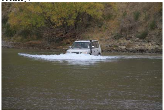
Crossing the Clarence River in NZ

route and some even more spectacular scenery.