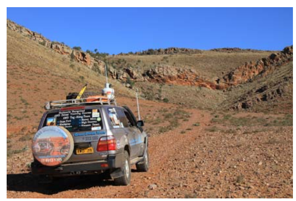
Some of the spectacular scenery you will see on my new Flinders Ranges trip.

After the First Across the Simpson Desert tour in late March I spent a couple f days exploring some more private station tracks in the southern Flinders Ranges which I have added to my Flinders Ranges trip commencing 5 September. Wow! Aren't they incredible, you will really enjoy the spectacular scenery and great 4wd tracks that these new properties have to offer. The Flinders Ranges is similar to the spectacle that the High Country provides, if you like dramatic scenery mixed with great 4wdriving, you really should join me in September in the Flinders.