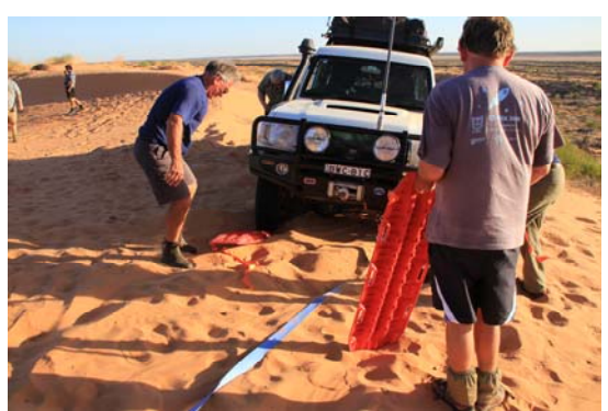
At times there was plenty of hard work in the heat and flies

On the morning of 16 March a lone 4wd passed us, and he would be the first across the desert for 2013, so we took the prize of the first group to cross the desert.