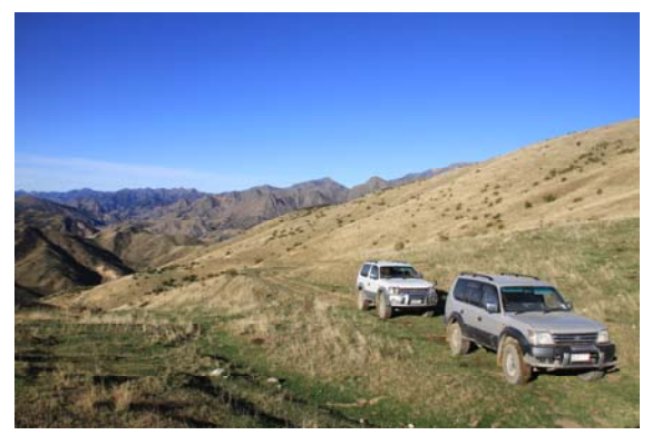
On the way to muzzle Stn

I have just returned from our 4th New Zealand 4wd tour, another magical 7 days exploring the beautiful Sth Island. This time we went north of Christchurch initially up the coast to Kaikoura with some deviations onto private stations where the rolling hills and 4wd tracks were excellent. Then we headed west from the coast into the Clarence Valley to one of New Zealand's oldest sheep stations, Muzzle station. It took us all day with some fantastic 4wd country to reach this isolated station. Our accommodation was in an 1860 built mud hut, all quite civilised given the age of the building. Colin and Teena Nimmo have owned Muzzle Stn since 1980 and they were our hosts cooking a delicious BBQ of local lamb, beef and venison.