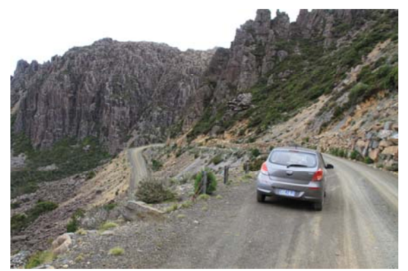
The i20 off roader on Jacobs Ladder.