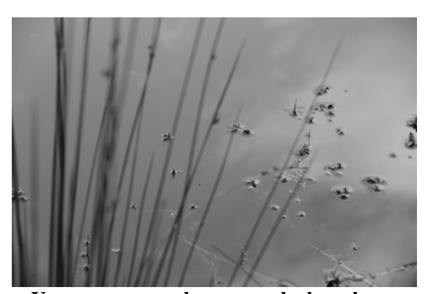
Yep, even mono chrome can look cool

Hot on the heels of Vivid Sydney is another of our very popular dedicated photo course weekends, conducted at my driver training facility at Braidwood. On the weekend of 15-16 June we are joined by Photo Phil from 10 am at Braidwood, Phil will conduct a series of class room and outdoor exercises all day on Saturday helping you to fully understand how your digital camera works and how to use all the special functions it provides. You then get to use these functions and new skills in our bushland back yard so you will see your results straight away and Phil will be looking over your shoulder offering his words of wisdom.