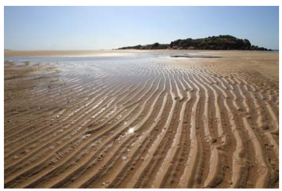
Places like this are truly special in Arnhem Land

I'm so pleased to say that I am going back again this year with 6 customers thus far, that means we have just 2 spots left on this amazing tour. Did you know that no other tour company spends as much time as us in Arnhem Land? Of our 19 day trip, 17 days are in Arnhem Land and we get to places most have never heard of. I'm still working with the local Aboriginal Tourism people and we may even have some more very special spots to visit. I'm really looking forward to spending another cold August in the 30 degree heat of Arnhem Land.