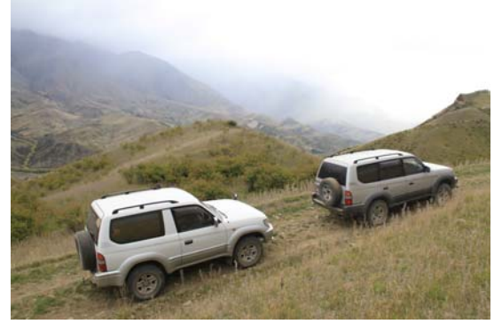
We drove up to the clouds

After this we headed over to the west coast where finally we found mountains that actually had tree cover on them. Here we did a track that had not had anyone through for a few weeks and had to rebuild the road through a couple of river crossings.