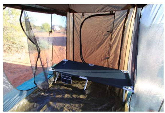
Just enough room for Stan's stretcher.

terms of its ease to pop up. It has 4 poles, one in each corner each requiring two guide ropes and pegs to maintain its rigidity in a breeze, so the end result is it is slow and awkward for one person to erect. Also, the roof section is held up by flexible spring loaded poles which, straight out of the bag had lost their spring tension and were near impossible to use. I'll be returning these poles and asking for replacements as surely that can't be right.