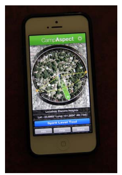
This new App will be helpful in the bush

How many times have you pulled into camp and wondered where the sun will rise so you can position your tent etc to catch the early morning sun to help warm it and dry it out as quickly as possible? Now you can just use the CampAspect App.