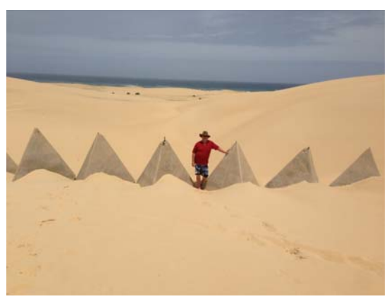
We can still access the tank traps on Stockton

To be honest there has been a marked drop off in the number of people visiting Stockton and local businesses must be really feeling the pinch. Regretfully I can't see NPWS changing the situation in the near future at all.