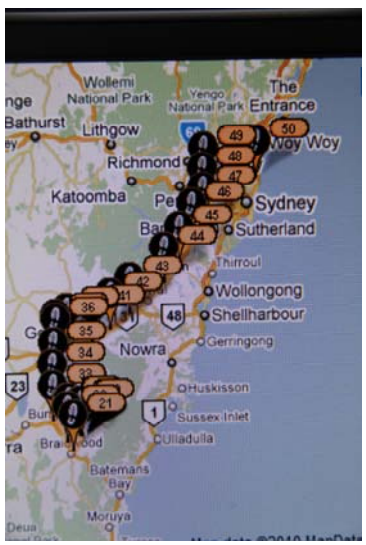
You can follow our trips via our Spot tracker.

Spot has been getting a real work out of late, tracing our Simpson Trip and then my tour through New Zealand, the track is still on the website so take a look here <a href="https://spotwalla.com/tripViewer.php?id=5f">https://spotwalla.com/tripViewer.php?id=5f</a> a2511c27c094e2d